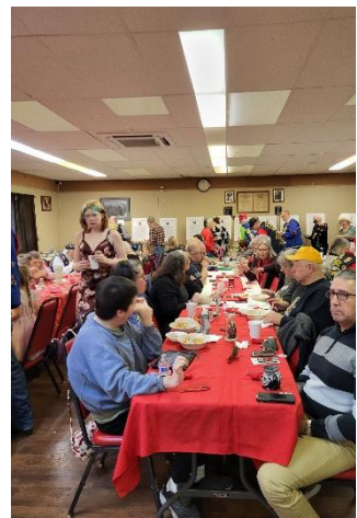
Additional photos may be found on the Base Facebook page.

To perpetuate the memory of our shipmates who gave their lives in the pursuit of their duties while serving their country. That their dedication, deeds and supreme sacrifice be a constant source of motivation toward greater accomplishments. Pledge loyalty and patriotism to the United States of America and its Constitution.